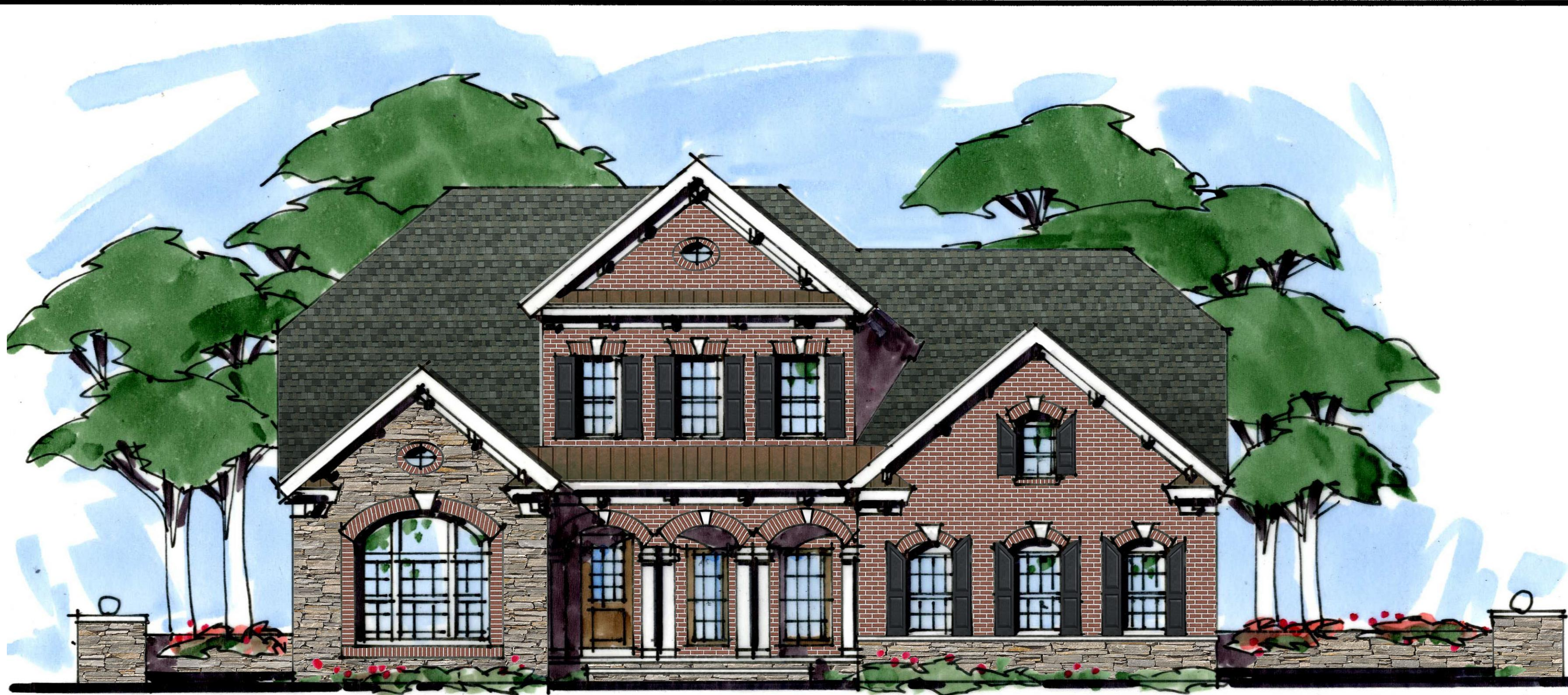
FRONT ELEVATION STONE | BRICK FRONT