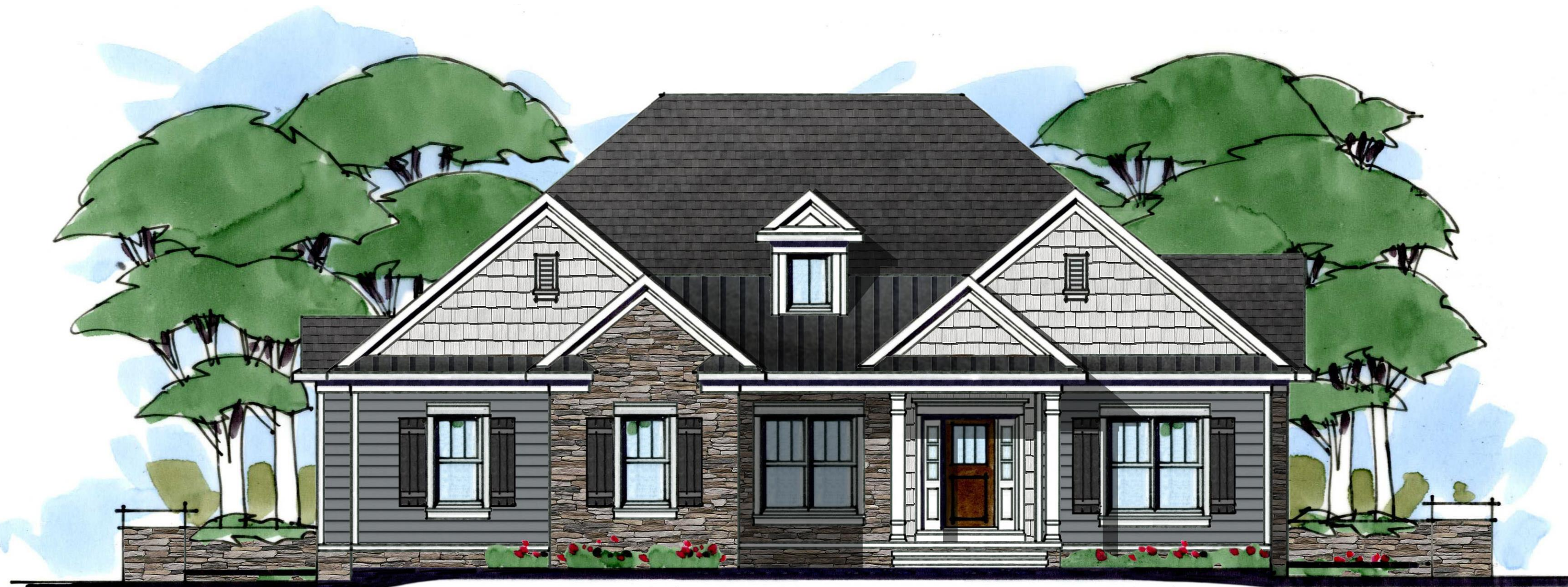
FRONT ELEVATION STONE | SHAKE SIDING FRONT