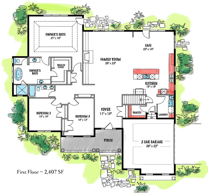
First Floor ~ 2,407 SF