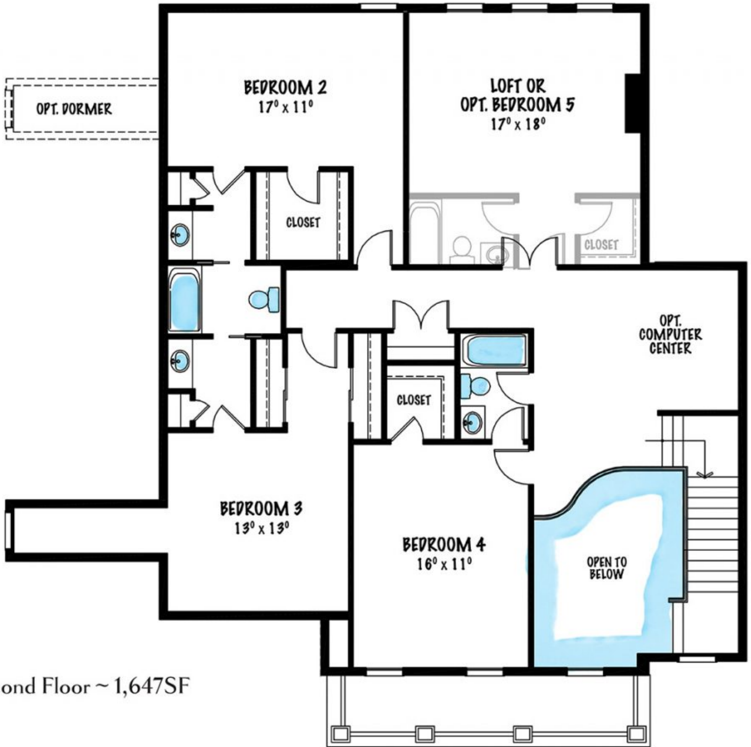
Second Floor ~ 1,647SF