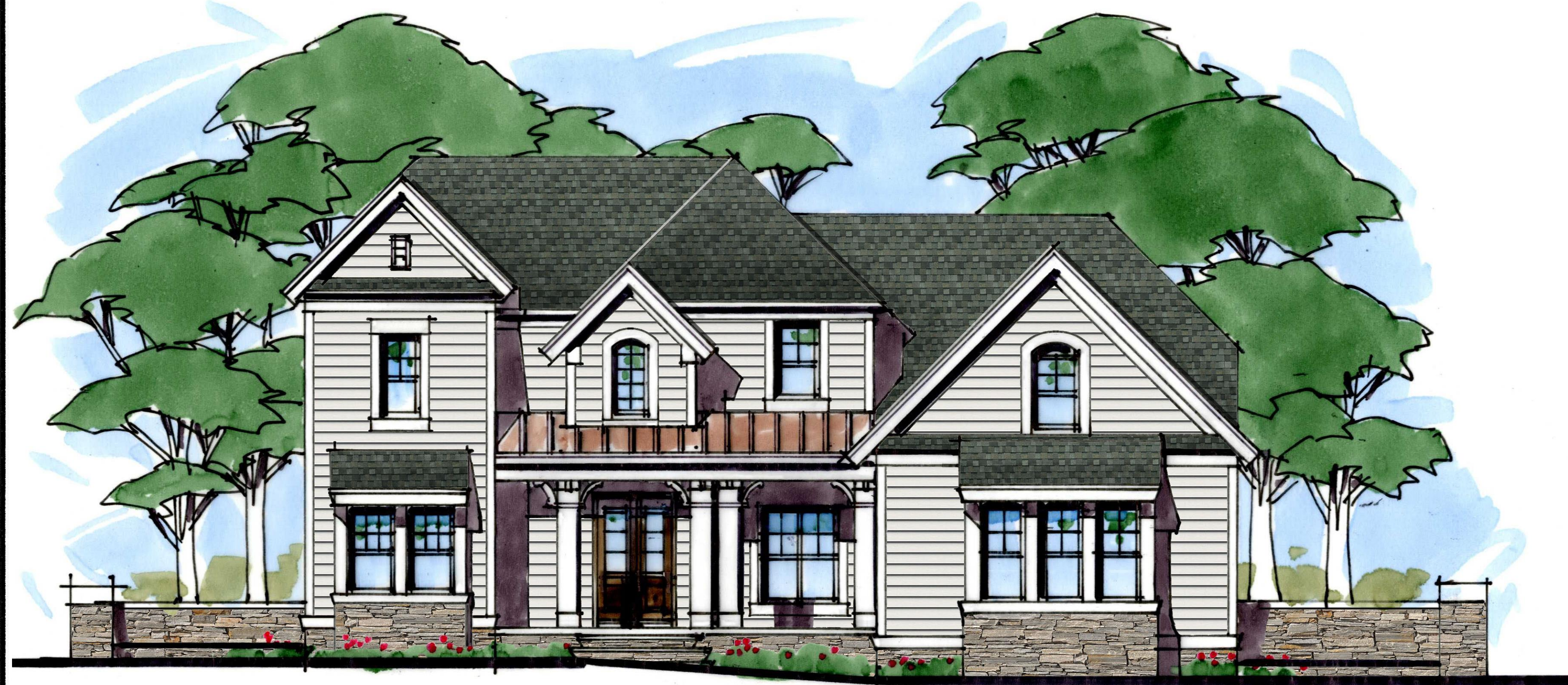
FRONT ELEVATION STONE | BRICK FRONT